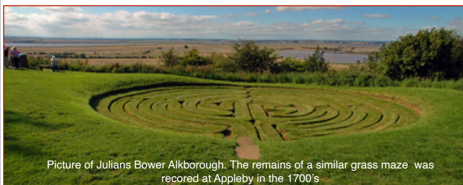
Picture of Julians Bower Alkborough. The remains of a similar grass maze was recored at Appleby in the 1700's