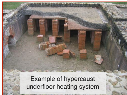
Example of hypercaust underfloor heating system

Although there has been no real evidence for a villa/farm in Appleby, the term villa covered a wide variety of establishments, some were just farms whilst some were the homes of men who managed estates or businesses. Villas have been discovered in Roxby, Dragonby and Winterton. Distribution of Roman settlements are often revealed by building debris such as tiles, hypercaust systems, pottery, oyster shells and bones of domestic animals. However, the native population usually lived in wooden huts.