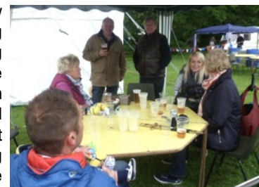
Visitors enjoying a pint outside the beer tent. See you next year!