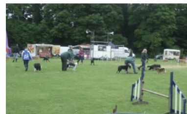
Newark dogs performing in the ring

It is with great relief that I pen this article about the success of this year's Appleby Fayre. At 10 am on the Saturday morning a brief conversation took place in which the key organisers dared to voice their concerns about the dismal weather outlook for the next day. It was quickly but firmly decided that, come what may, the show had to go on! And so it did!