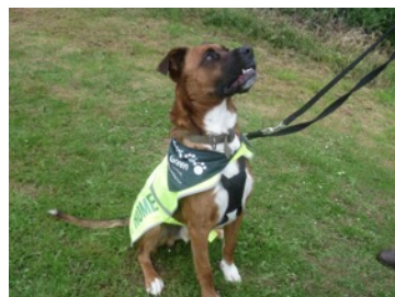
Winner of "The dog the judge would most like to take home."

We found that although numbers were reduced due to the disappointing weather, those that did turn out had a lovely day and our visitors kept coming thought the gates to enjoy the delights of this year's events. The range, was as ever varied and hopefully suited all tastes. Barton Town Band opened proceedings with a parade round the village assisted by the majorette troupe. Newark dogs performed with flair and there were more displays from the Karate school, pom pom dancers, majorettes, tug of war and the ever faithful classic car and tractor parade, which this year included 3 vintage fire tenders.