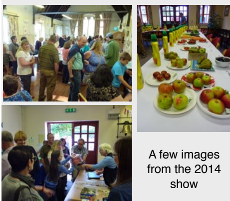
A few images from the 2014 show

The show is open to all residents, close family and those closely associated with the village. So roll up your sleeves, spread the word and lets make it a day to remember!