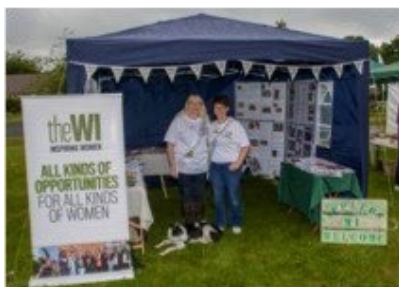
WI Stand Appleby Fayre